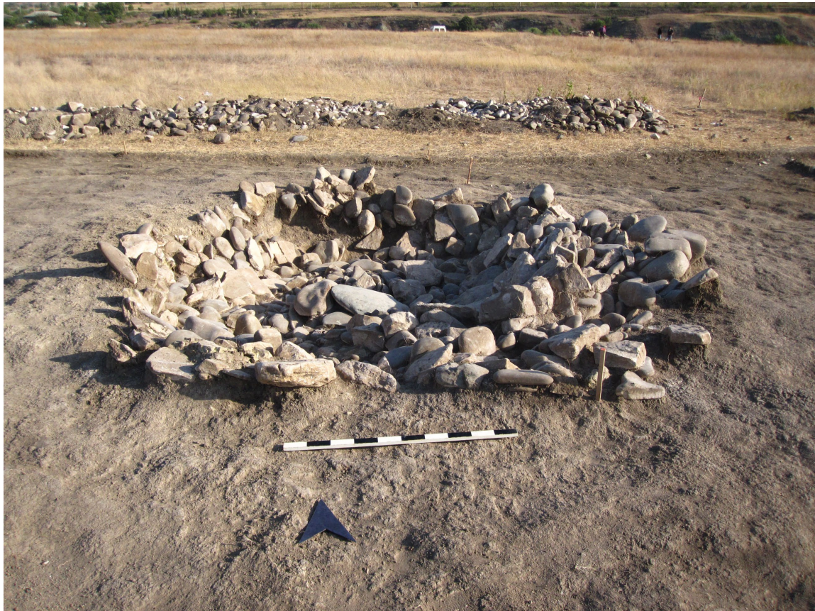
Fig 5. View of the central pit of Kurgan 2 from S

A third Late Bronze Age pit was located at the NW periphery of the kurgan ( Fig. 6 ). It was also covered by the stones of the kurgan's mound, from the outline of which is slightly projected. Its location was marked by a cluster of very large out of place white stone slabs, which might have originally belonged to some structure connected with it. The pit was ca 40 cm deep: on the top it was roughly circular and measured 120 x 150 cm, while on the bottom it was ovoid in shape, oriented in SW-NE direction, and measured 155 x 95 cm. It contained two smashed pottery jars with very typical Late Bronze combed decoration, and scattered animal bones.