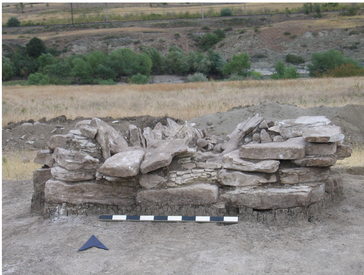
Fig 3. View of the burial chamber of Kurgan 1 from S.

A low overground chamber of squarish shape, also oriented in NW-SE direction, was located approximately in its centre. It measured 240 x 220 cm, and was ca 40 cm high; its walls were 40-50 cm wide, and were made of large flat slabs of whitish sandstone ( Fig. 3 ). The burial chamber had originally been covered with flat stone slabs of the same type, which had partially collapsed inside it due to the weight of the overlying stones. The filling of the 160 x 140 cm space inside the chamber was preserved only for ca 10 cm under the collapsed stones. It contained two smashed pottery vessels, which were both located in the northern half of the grave, in its W and respectively E part. Both were small single-handled carinated pots of fine black-coloured Bedeni pottery with corrugated shoulder and with finely incised decoration in the area of the carination. A few badly preserved fragments of human bones (among them one tooth) were found in the NE corner of the chamber. They were so few that it may be doubted that the kurgan ever contained an entire skeleton.