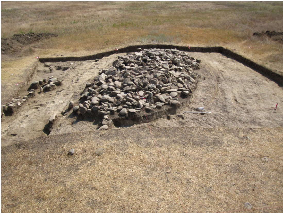
Fig 2. View of Kurgan no. 1 from W s

As excavated, the stone mound of kurgan no. 1 measured 10 x 4.50 m, and had a maximum height of 70 cm. It had the shape of an elongated oval, oriented in NW-SE direction ( Fig. 2 ).