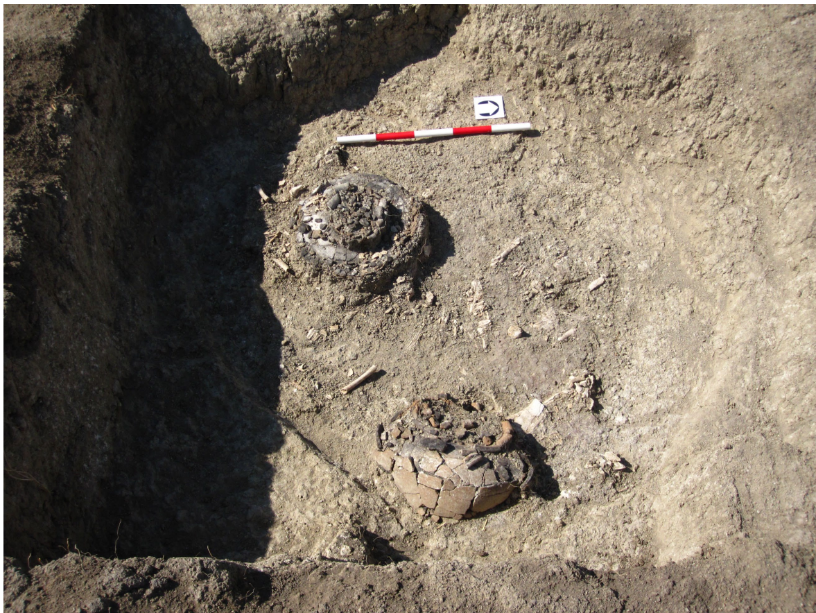
Fig 6. View of Late Bronze Age ritual pit from E