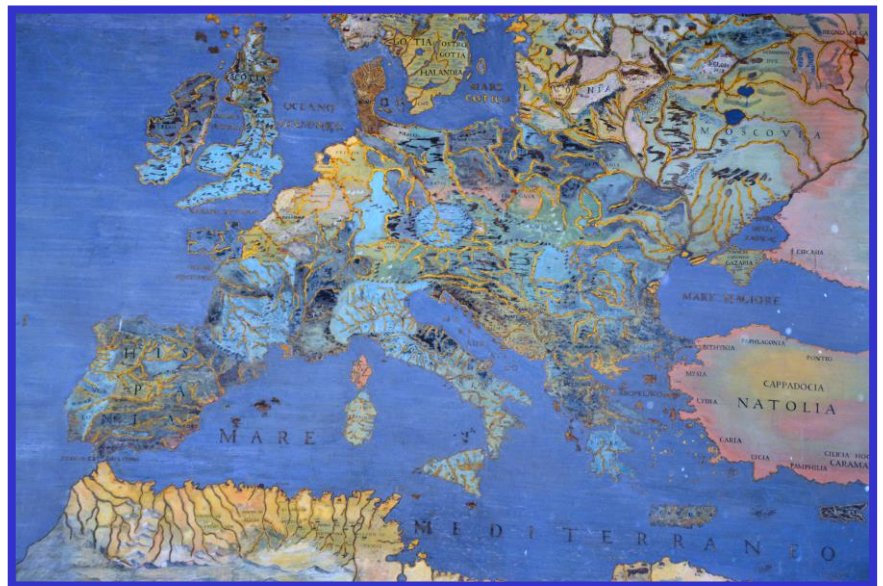
Image: Europe, Sala del Mappamondo, Palazzo Farnese (Caprarola, Italy).